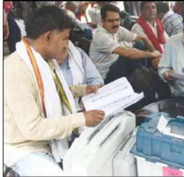
Polling officials checking the Electronic Voting Machine (EVMs) and other necessary inputs required for the General Elections-2014, at the distribution centre, at Varanasi, Uttar Pradesh

Delhi Correspondent New Delhi/May 18 The Assam Aom Party (AAP) on Friday alleged that the election commission had got polling diaries manipulated by changing officers in the South Delhi parliamentary seat after the general election held on May 12.